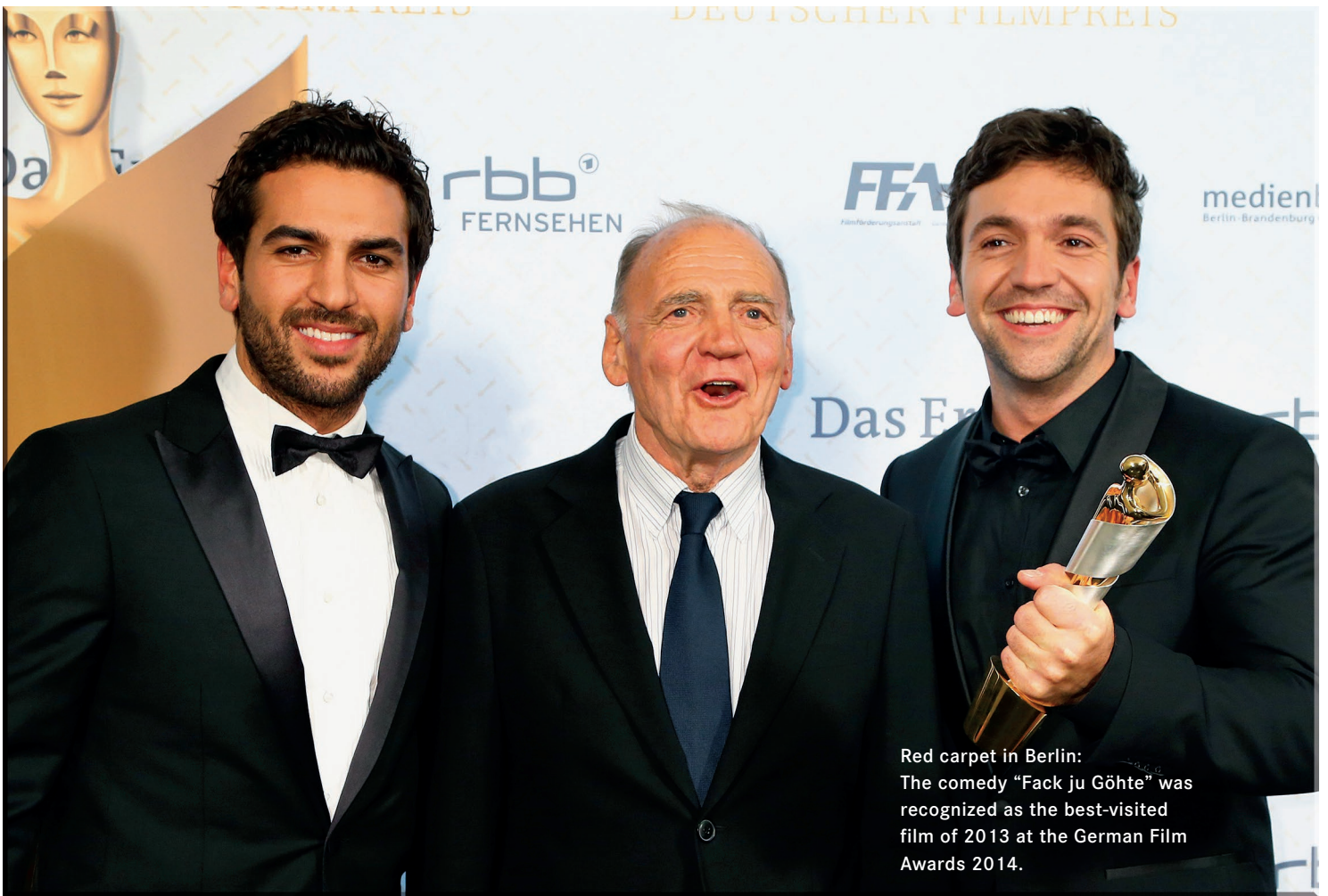
Red carpet in Berlin: The comedy "Fack ju Göhte" was recognized as the best-visited film of 2013 at the German Film Awards 2014.